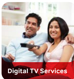
Digital TV Services